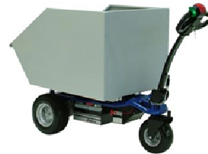
Skip 1210x800xh700 500Lt