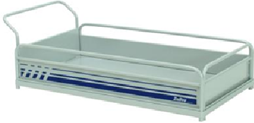
Platform removable parapets 695x1250x240