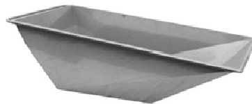
Galvanised Skip 300Lt

Hercules Complete Lifting Solutions Unit 2, 18 Hotham Parade ARTARMON NSW 2064 Toll Free: 1800 649 603 Ph: (02) 9966 5600 Fax: (02) 9966 5622 info@hercules.com.au www.hercules.com.au