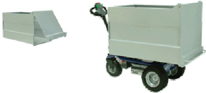
Platform 800x1250xh750 700Lt