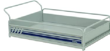
Platform removable parapets 885x1250x240