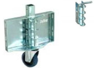
Galvanised Hitch M Series