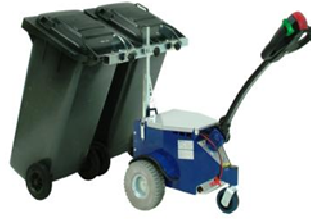
Galvanised Bin Hitch