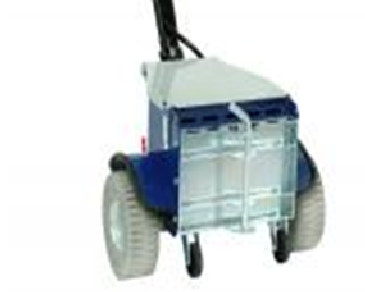
Tug 1 Galvanised Hitch